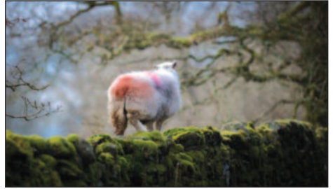
Herdwick sheep on wall in Borrowdale

We have a unique stake in farming in the Lake District, not least because it shapes a landscape that is loved by millions and one that is now a UNESCO World Heritage Site - which recognises the cultural tradition of farming. We want Trust farms to stand out as places delivering great things.