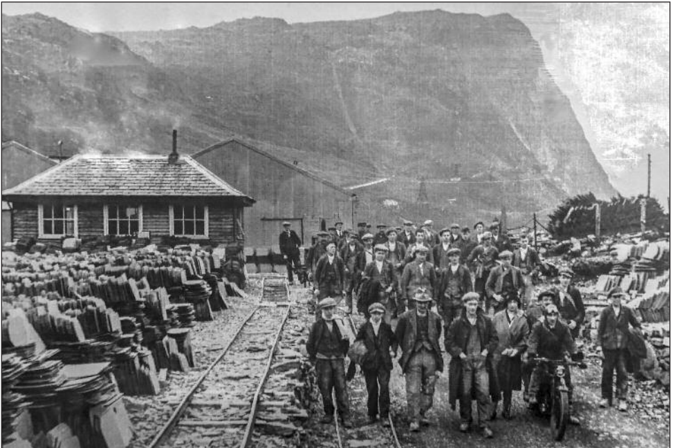
Thanks to the Langstrath Country Inn for the use of this photograph

We already have a few photographs, but we would love some more. We have a few written records, but more would be brilliant! If you've got memories or tales to tell, we would love to hear them!