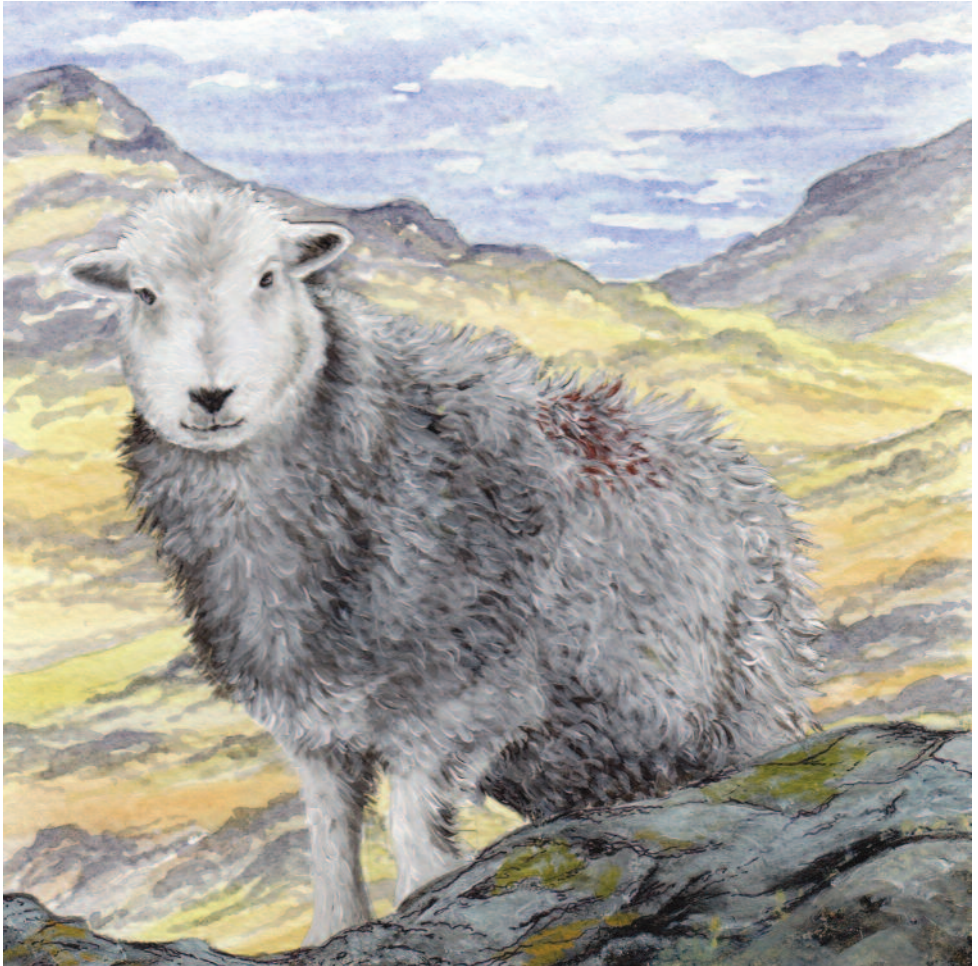
"Herdy on the Hill" by Gill Bulch

Sponsors for The Borrowdale News 2019/20 - The Scafell Hotel